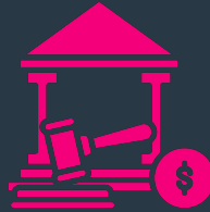
A Major Financial Regulatory Body